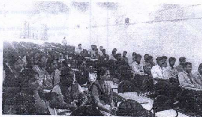
A view of the participants in the awareness camp

Handwritten signature in red ink 11/2/19 VP